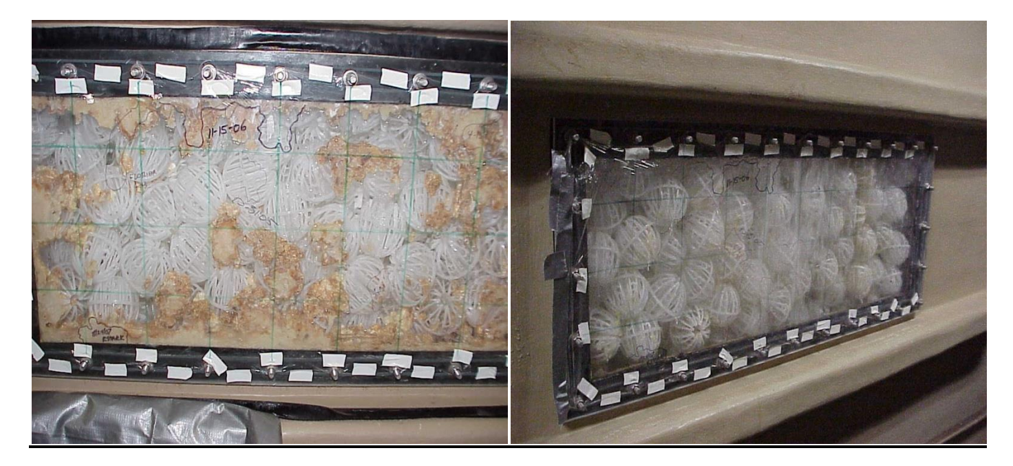
Figure 4 (left) shows significant mass of biofilm (light brown areas) in scrubber #1 media prior to the application of chlorine dioxide. Figure 5 illustrates the clear impact of chlorine dioxide after 3 months of application.