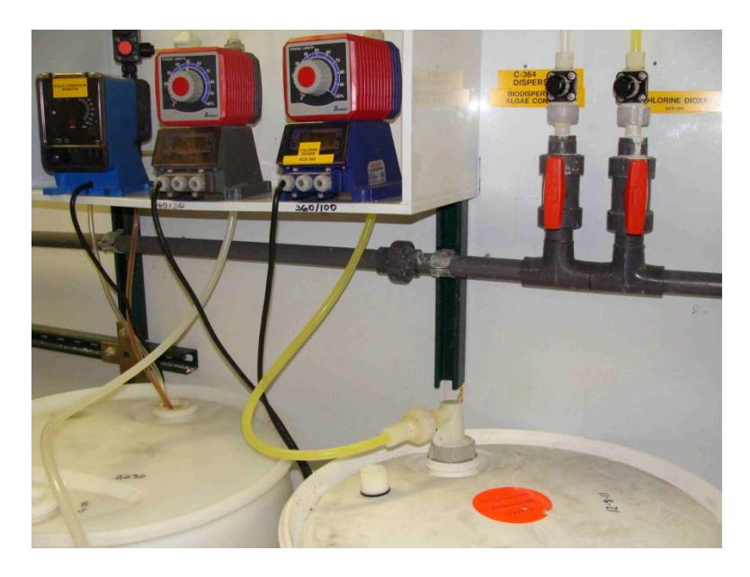
Figure No. 3.

Aqueous chlorine dioxide solution being fed from 55-g container during the trial. Drum fitting (Colder) is high-density polyethylene (HDPE) and tubing from drum to pump is polyethylene. Teflon<sup>®</sup> or Kynar<sup>®</sup> tubing recommended for long-term applications.