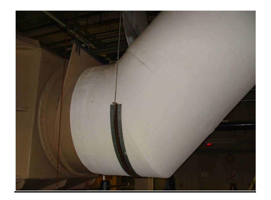
Figure No. 2.

Flow schematic of VOC wet scrubber system. Total water volume was 1200 gallons with a recirculation rate of approximately 550 gpm.