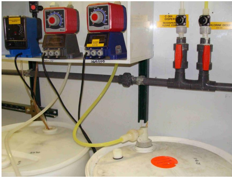
Figure No. 3.

Aqueous chlorine dioxide solution being fed from 55-g container during the trial. Drum fitting (Colder) is high-density polyethylene (HDPE) and tubing from drum to pump is polyethylene. Teflon® or Kynar® tubing recommended for long-term applications.