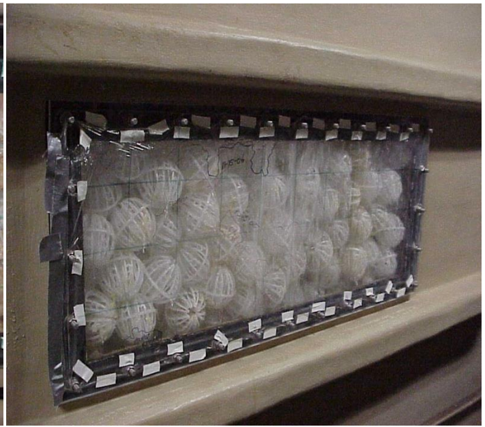
Figures No. 6 and 7.

Figure 6 (left) shows significant mass of biofilm (light brown areas) in scrubber #2 media prior to the application of chlorine dioxide. Figure 7 illustrates the impact of chlorine dioxide after 3 months of application.