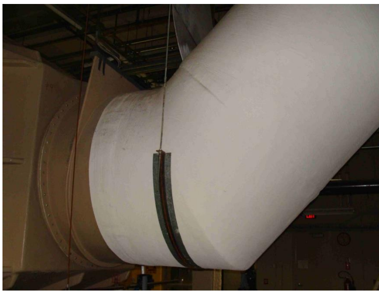
Figure No. 2.

Flow schematic of VOC wet scrubber system. Total water volume was 1200 gallons with a recirculation rate of approximately 550 gpm.