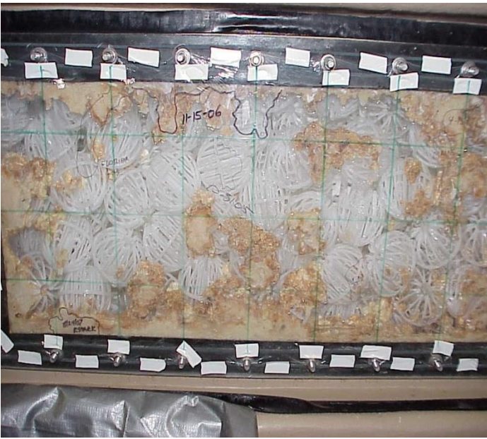
Figure 4 (left) shows significant mass of biofilm (light brown areas) in scrubber #1 media prior to the application of chlorine dioxide. Figure 5 illustrates the clear impact of chlorine dioxide after 3 months of application.