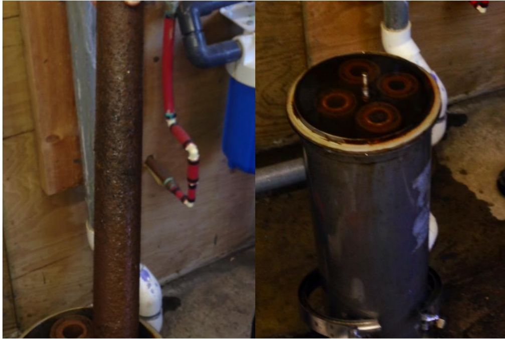
Figure 4. A 20- \mu\text{m} filter after approximately 5 months of service (left), following implementation of the chlorine dioxide system. The pressurized filter housing unit is shown on the right.

approximately 30 minutes downstream of the injection point, 3) increasing the filter run times from 5 days to 5+ months, and 4) decreasing the overall filter budget of the plant by approximately 70 percent.