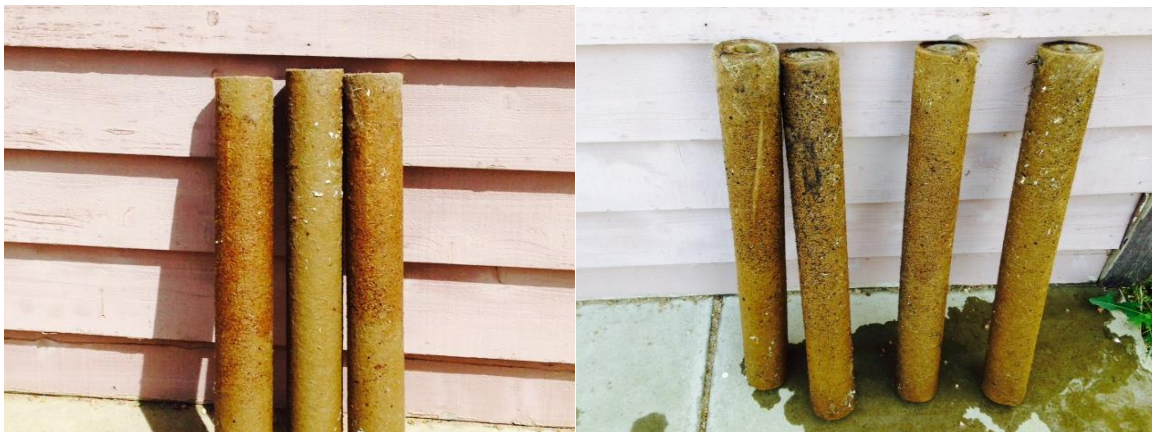
Figure 3. The 20-µm filters approximately 2 weeks (left) and 6 weeks (right) after the start-up of the ClO 2 system. Virtually no change was detected in the performance of these filters during this period (contrast with filter in Figure 1 after 5 days, prior to ClO 2 addition).

2 Escherichia coli accounted for 1 cfu/mL.