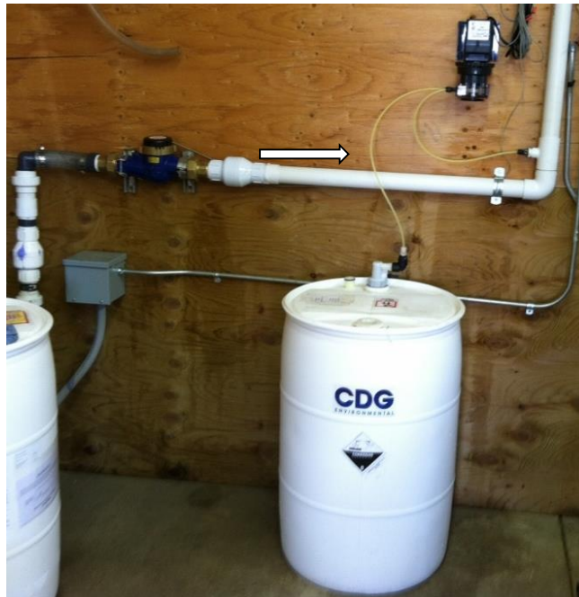
Figure 2. Chlorine dioxide feed system. The 0.3% aqueous solution is contained in the white 55-g drum. Arrow shows the direction of water flow. Peristaltic pump is in the upper right corner.